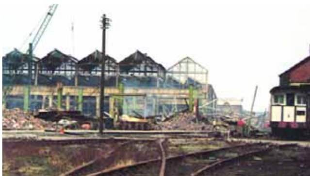
Brunel's Railway Engineering Works, Swindon

Structural Demolition ● Internal Stripping Out Site Clearance ● Associated Building Works Emergency Dismantling ● 24 hour Emergency Service Temporary Works ● Specialist Advice Façade Retention ● Asbestos Removal Demolition Management ● Budget Cost Plan Preparation