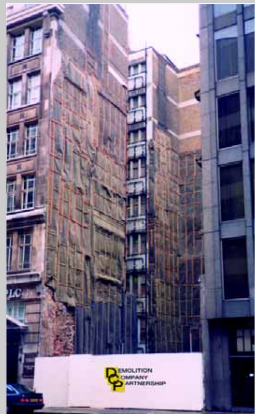
Leadenhall Street EC3

DCP has worked as principal contractor on many schemes over the years and holds substantial Public and Employers liability insurance.