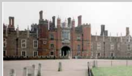
Hampton Court Palace

For further details and advice without obligation, please contact DCP as detailed overleaf.