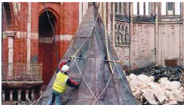
All Saints church, Dulwich