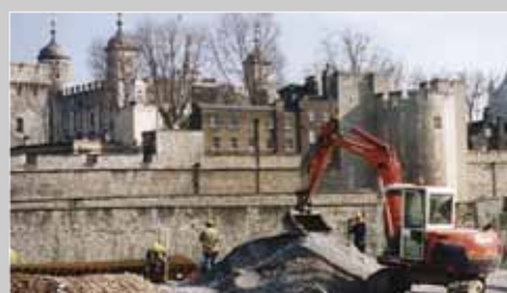
Tower of London Environs scheme