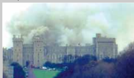
The 'Great Fire' at Windsor Castle